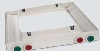
Green & red drain pan plugs to identify primary vs. secondary