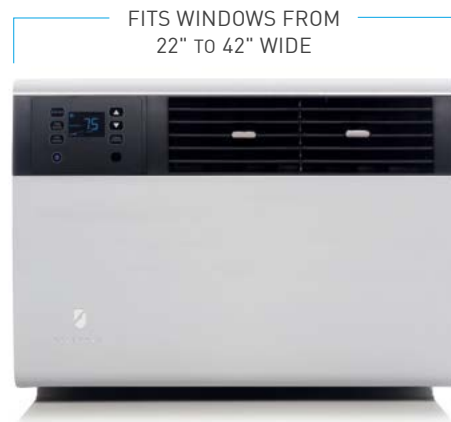
Kühl SQ/EQ Models

Rugged hardboard side panels help reduce noise and keep out light. The unique air path is more streamlined, drawing air through the sides, away from moving parts. Our larger discharge vents allow for smoother airflow, delivering maximum conditioned air quietly.