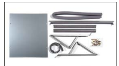
KWIKSB, KWIKMB, KWIKLB