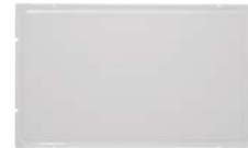
Outer weather panel