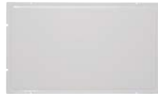
Inner weather panel

Sleeve is shown at right with standard painted steel inner panel, painted steel outer panel and standard grille