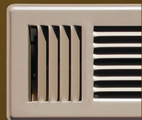
153MB - Brown

Always at the forefront of technological innovation, TruAire's new and ground breaking 3-Way Floor Register is one of the many great new products offered with our patented SmoothGlide Technology. These registers have been specifically designed for greater airflow which means lower energy costs for your home. Available in either white or brown finish and in standard 4"x10" and 4"x12" sizes.