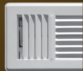
153MW - White

TRUaire's NEW 3 WAY FLOOR REGISTER. MORE EFFICIENT AIRFLOW PROVIDES GREATER ENERGY SAVINGS.