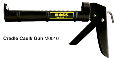
Cradle Caulk Gun M0016