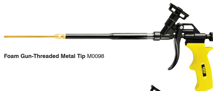
Foil Gun-Threaded Metal Tip M0098