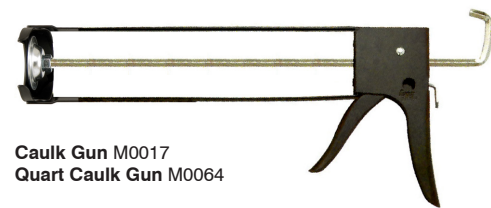
Caulk Gun M0017 Quart Caulk Gun M0064