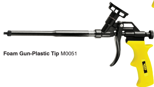
Foil Gun-Plastic Tip M0051